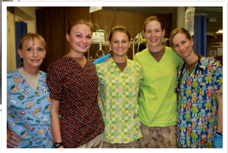
U.S. & Canadian nurses & doctor wearing donated scrubs.