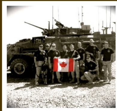
ICER H2H shirts in Afghanistan