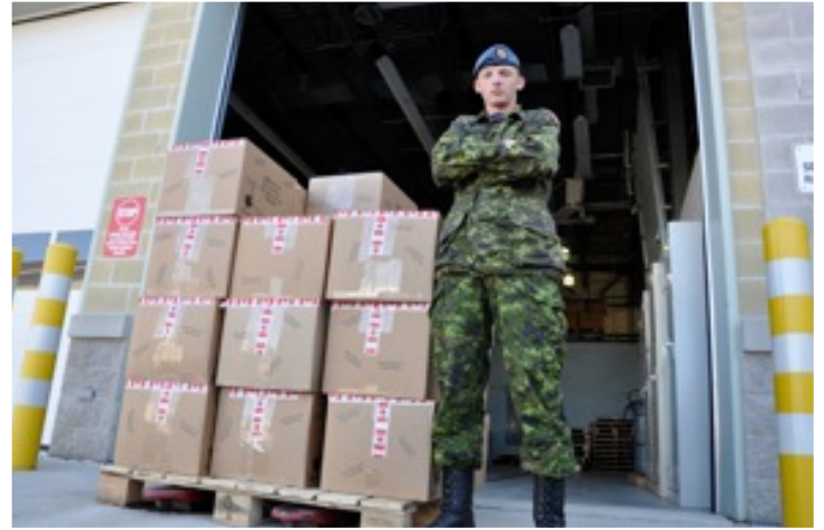
London Area Support Unit. The journey to Afghanistan begins.

We launched our new Canadian website, HeroToHeroTeamCanada.com in conjunction with HeroToHero.US