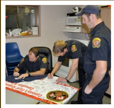
Brandon, Manitoba firefighters sign t-shirts and a banner.