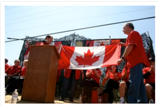
Flag signed by Jack Babcock presented to Peter MacKay

Events have included Red Friday Rallies in Point Edward, Waterloo, and Petawawa, Ontario. At the Red Friday Rally in Petawawa, we had the honour of presenting the Minister of National Defence, Peter MacKay with a Canadian flag signed by Jack Babcock, Canada's only living World War One Veteran. Jack also happens to be a Celebrity Hero Ambassador for Hero To Hero.