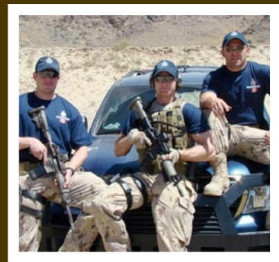
Troops wearing York Regional Police shirts & hats.

Today there are approximately 3300 Canadian troops deployed around the world. Although the majority of them are in Afghanistan, Canada also has troops deployed in places like Sudan, Haiti, Israel, Balkans and other distant lands. Another 5000 troops are preparing to deploy or returning from deployment. Hero To Hero Team Canada gives first responders an opportunity to show our deployed troops we have not forgotten them as they serve our country in far away lands. No politics involved... simply a troop morale boost.