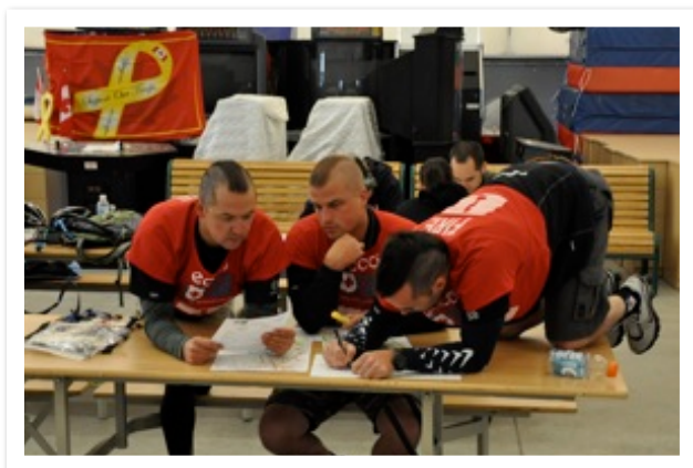
Firefighters charting their course at ESAR