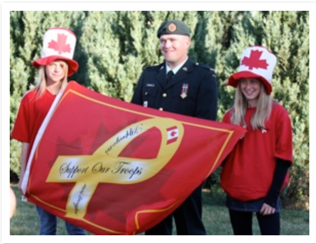
Point Edward, Ontario