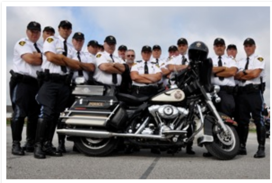
O.P.P. Officers posing for the HeroToHero "Badass" photo.