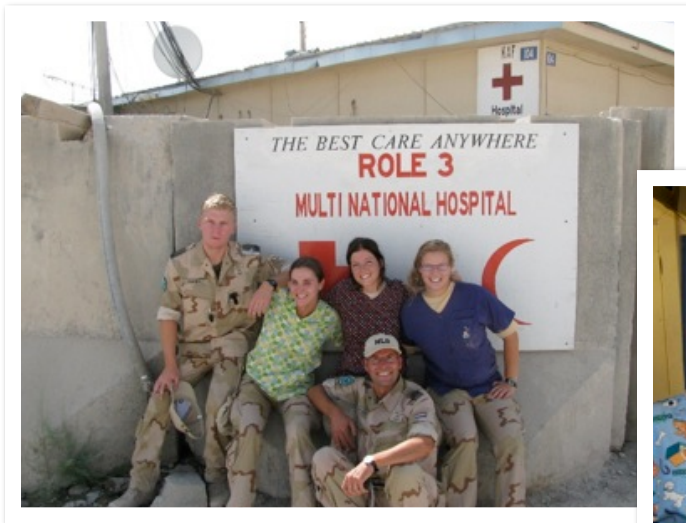
Dutch medical staff wearing donated hospital scrubs.