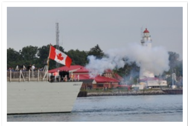
A salute to those lost on 9/11